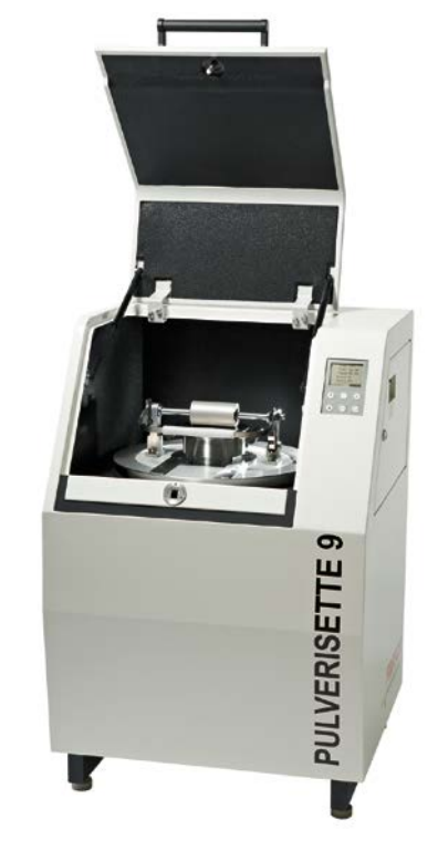
Vibrating Cup Mill PULVERISETTE 9

Accessories: We recommend hardened steel or chromium-free tool steel grinding sets for most applications. For extremely hard samples grinding sets made of hardmetal tungsten carbide should be used. For glass and ceramics are grinding sets made of zirconium oxide suitable and for soil samples agate grinding sets.