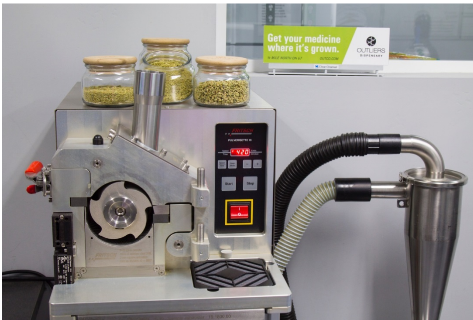
Fig. 2: Universal Cutting Mill PULVERISETTE 19 and ground cannabis samples

Other applications OutCo uses the mill for is sample preparation for rosin pressing and milling of flower for pre-roll production. It was found that different particle sizes optimize draw behavior or item stability.